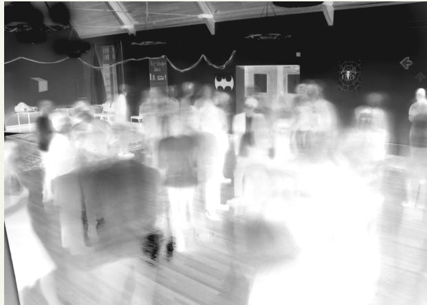
The Hillcrest ghost population enjoys nothing more than to jump up, jump up, and get down.

However, we do have a plan. Ladies and gentlemen, I am proud to announce that for the past month the Hillcrest RAs have recently been following my expert advice: to purposely throw the NerdFest competition. The only way to rid our beloved building of these unwanted houseguests is to convince them that there is a better home for them waiting in Main Campbell. Since ghosts desire nothing more than the power derived from egghed neural energies, they will obviously see the Main Campbellonian win as an opportunity to strike that building whilst their guard is down. You can thank me later.