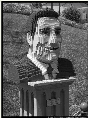
President Bush expects for this Lego statue of Governor Schwarzenegger to be pulled down triumphantly when the U.S. Army soldiers are greeted as liberators by the oppressed people of California

"No one doubts that the Arnold Schwarzenegger is dangerous. Sure he just got re-elected with 70% of the vote, but after all, Saddam Hussein got 99% of the vote just before we ousted him from power. It is suspicious when people don't win by the skin of their teeth. It just isn't logical," Bush exclaimed.