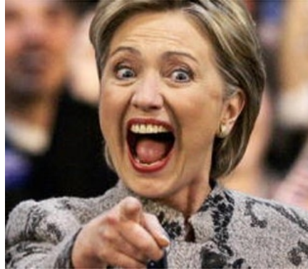
Hillary Clinton: The sexiest hill around.