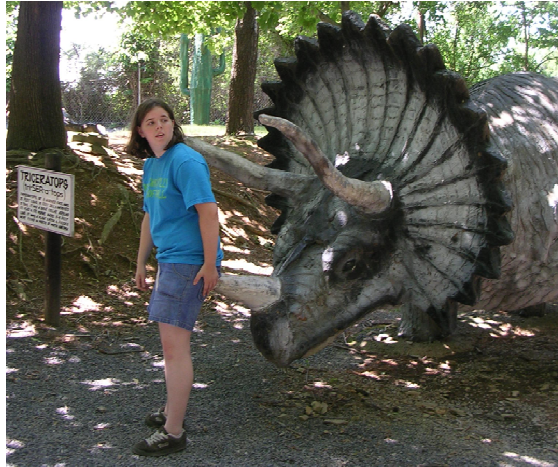
Doing some investigative journalism

On a related note, the New York Times recently reported that 63% of the Neanderthal genome has been decoded. According to Dr. George Church of Harvard Medical School, cloning and reviving the Neanderthal legacy would only take a mere 30 million dollars. This reporter is excited about the future prospect of marginalizing a new