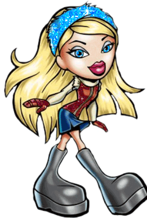
This outfit only keeps you warm if you're a cartoon.

These are just a few of the varieties of freshmen popsicles that will be available for purchase this year. Other varieties include Corp of Cadets freshman (without a coat because the Corp screwed up again and forgot to order them), bicycler with frostbitten hands (your mom was right to pack gloves in your boxes at fall break), and my personal favorite, displaced southern, complete with shorts, flip flops, a t-shirt, and iced tea.