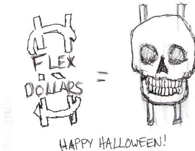
This picture was drawn with a sparkly pink pen.

So you walk into West End and see that perfect $1 (menu price) item. "I'll have that," you say pointing a finger quivering with ex-