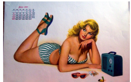
If all else fails, just study this broad.

should only be used as a last resort. If you must get a job, try to make it something fun, like clubbing baby seals.