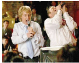
Trying to pick up bridesmaids