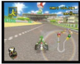
A well-placed banana peel