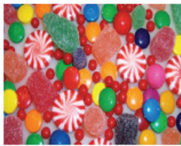
Its sugar high wears off