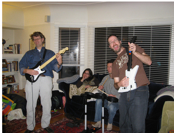
Nope, I checked on it myself. They're serious.

Does this mean the end for traditional instrumentation in music? The answer, according