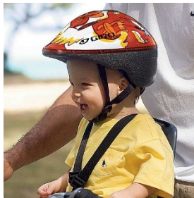
This young child has already been inducted into "helmet society."

The point is, kids think it's cool to do stuff like riding a bike before they're really able to do so. Some kids will "outgrow" two or three bikes before they settle on the one they'll ride as an adult. That's a waste of bikes, not to mention it puts kids at risk for premature scarring. We believe scars are only okay when you're old enough to look cool for having them.