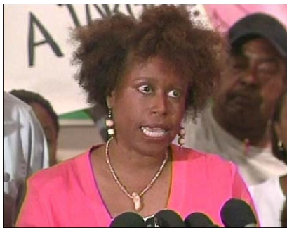
Cynthia McKinney on a good hair day.

For the last 427 weeks, America has concerned itself with a few political questions. Who will win the major party nominations? Who will the nominees choose as their running mates? Wait, who is Sarah Palin? When will this all be over?