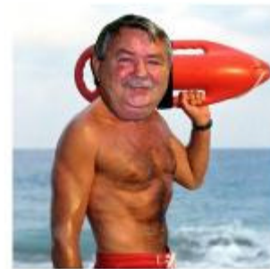
4) I would rather not say anything else about this photo