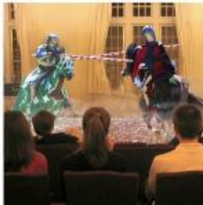
2) Coffeehouse featured much more exciting acts