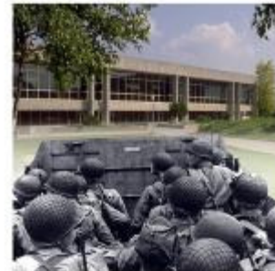
1) Instead of D2sday, they just had D-Day. It was a lot less fun.