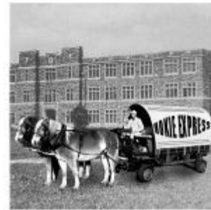
7) The Hokie Express was even less...uh...express