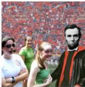
5) Different, but equally lovable, celebrities visited campus on occasion