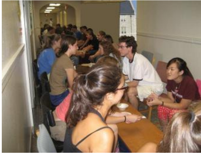
Main Campbell residents hold a séance in a vain attempt to determine the location of their former patriarch's room, center.