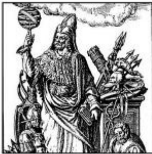
9) Many Honors students triple-majored in Alchemy, Astrology, and, of course, Classics