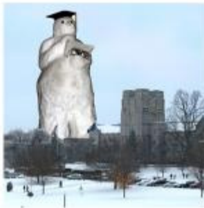
8) Less global warming = larger Snow Jack = slightly more obvious secret plan