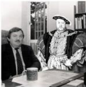
3) Jack tried to woo different rich people to make donations