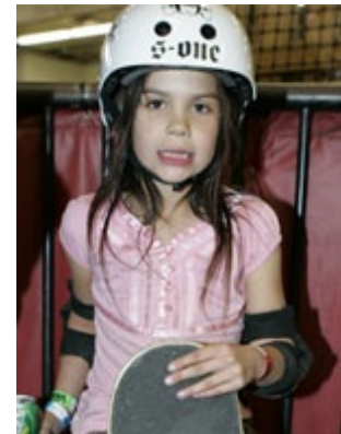
One of Paris' burlier roller guards.