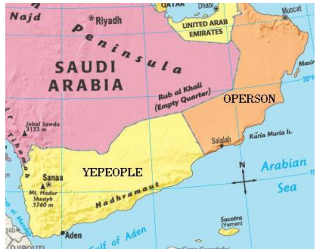
Above is one of the changes being made at UVA to lessen the oppression of women studying Geography.

The BITCH hopes that the establishpeople of