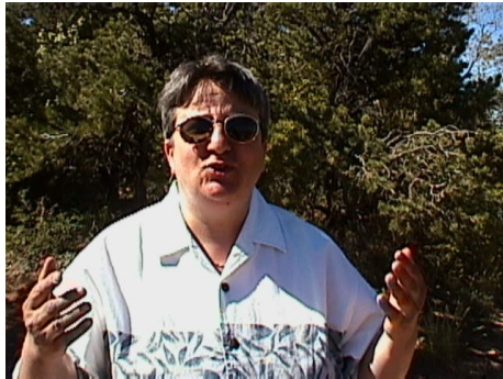
“What, you want you should be skinny?”

Greetings, gentle reader. In this first week returning from spring break, I certainly hope you've all had your fill of cabana boys, hula girls and sunburns. As we do our best to get back into the swing of things here at Virginia Tech, I'd like to remind you all of what it's like to be around this many Jews at the same time. I realize, due to the fact that we usually spend our breaks counting money or working in television, that the concentration of Jews is usually not that great on the typical vacation. However, we're all