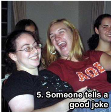
5. Someone tells a good joke