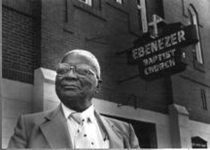
The Reverend Martin Luther King Sr. stands outside Ebenezer Baptist Church, where he was pastor for several decades, in 1981.

Michael King was born in 1929 and remains to this day an interesting and often mysterious figure. He was the son of a preacher and grew up to work for reform along with the black rights movement. At an early age he was heavily influenced by Ghandi and decided to try and initiate change within the US in a