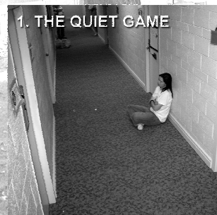
1. THE QUIET GAME