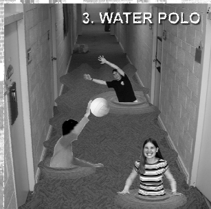
3. WATER POLO